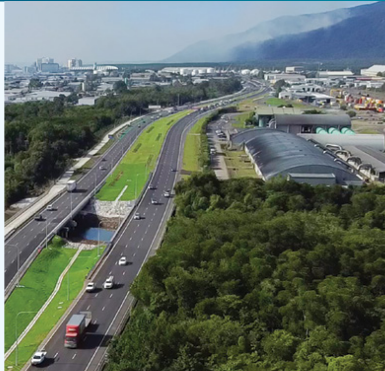
Cairns Southern Access Corridor (Stage 4), Kate Street to Aumuller Street, Peter Moss Bridge over Chinaman Creek (June 2021).