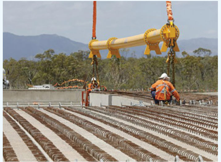
Townsville Ring Road – Stage 4 upgrade, completed 2016.

With more work to do, this Safer Bruce 2030 Action Plan outlines targeted safety treatments, and other safety measures, including technology, enforcement, education and behavioural change to improve safety outcomes and help realise the 60 per cent target of reduced fatalities by 2030.