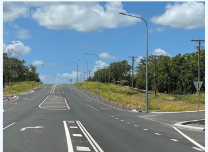
Neilsen Avenue – Angela Road intersection, north of Rockhampton.