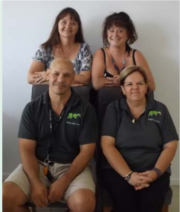
Staff of the Mossman Elders Justice Group and Mossman Community Centre

In 2018, the group held Men's Group meetings each Monday that has on average 12 men attending regularly. In addition to the Men's Groups, the Justice Hub hosts service providers including Relationships