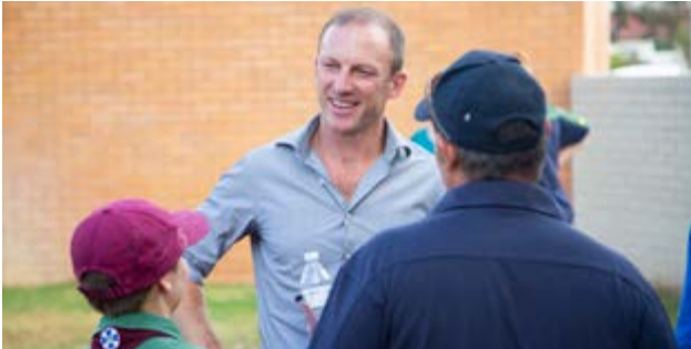
Darren Lockyer during the Beyond the Broncos trip to Charleville