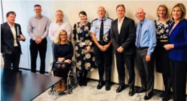
Council members attending a meeting of the Queensland chapter of the Male Champions of Change facilitated by PwC