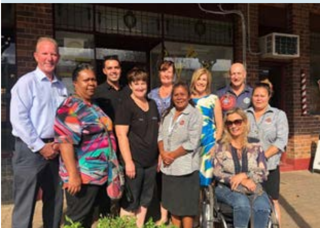
Council members and representatives from the Far West Indigenous Family Violence Service during Council's visit to Charleville