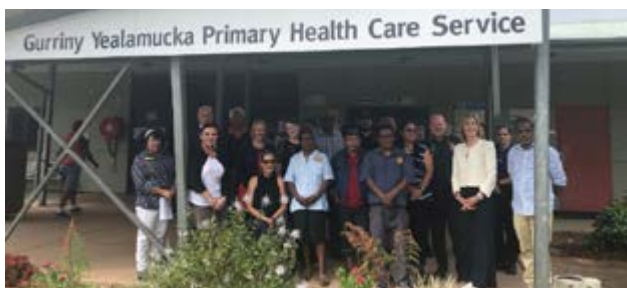
Members of the Council and the Yarrabah community during the Council's visit in May 2018

In the audit of domestic and family violence services conducted in response to recommendation 71 of the Not Now, Not Ever report, Cairns and Yarrabah formed part of the Far North Queensland region, which also included the local government areas of Cassowary Coast, Mareeba and Tablelands. The Far North Queensland region was found to have 13 domestic and family violence-related services, comprising four counselling support programs, three legal services and eight specialist homelessness services 3 .