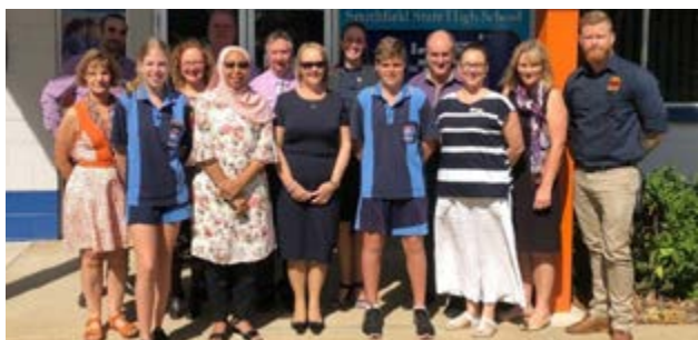
Council members meet with school representatives at Smithfield State High School in Cairns