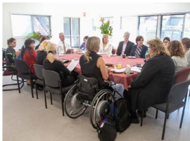
Council members meet with representatives from George Street Neighbourhood Centre Inc.

The Council notes that additional funding investment, including the commencement of the new Mackay high risk team in 2019 and the planned establishment of a new Aboriginal and Torres Strait Islander domestic and family violence service announced during the Council's visit, will serve to further strengthen Mackay's response.