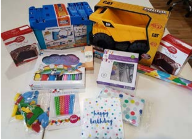
Birthday packs provided by Strategenics