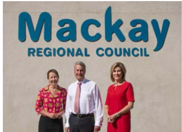
The Honourable Di Farmer MP, Minister for the Prevention of Domestic and Family Violence, Cr Greg Williamson, Mayor of Mackay and Kay McGrath

The Mackay Regional Council was also chosen for the Domestic and Family Violence Prevention Toolkit Trial that provides resources, tools and templates to enable and empower councils to take action and sustain action to reduce domestic and family violence.