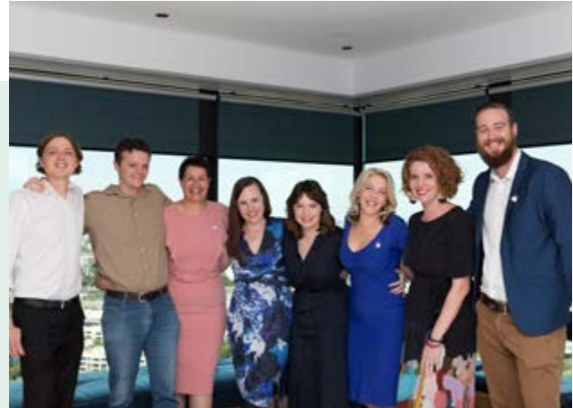
Staff from Australia's CEO Challenge

ACEOC partnerships come in all shapes and sizes. Sometimes it's the little things that make all the