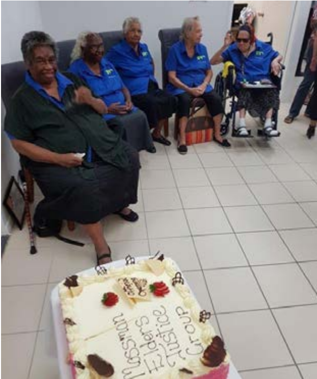
Members of the Mossman Elders Justice Group