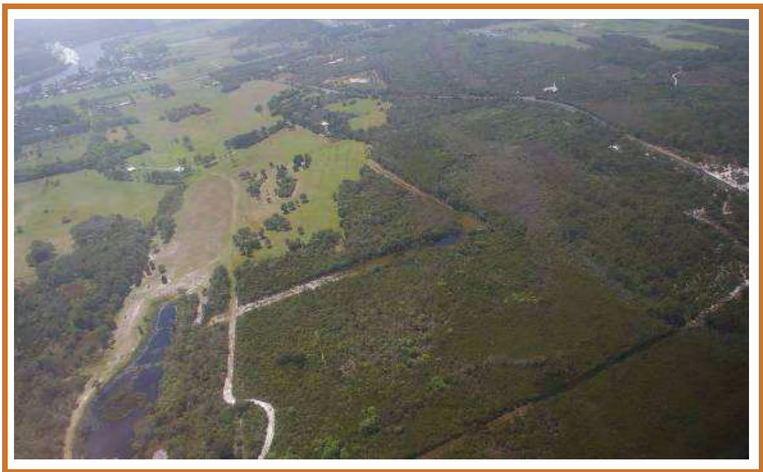
Figure 11.6: Site 18, Broadwater