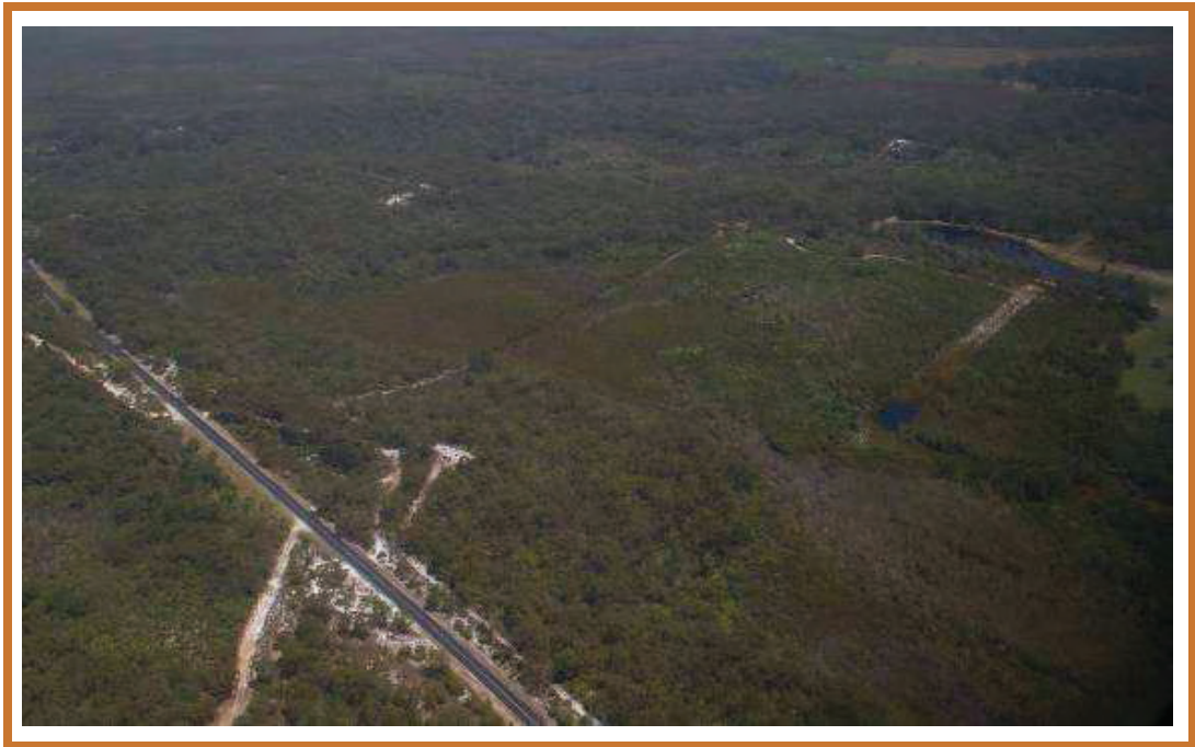
Figure 11.5: Site 18, Broadwater