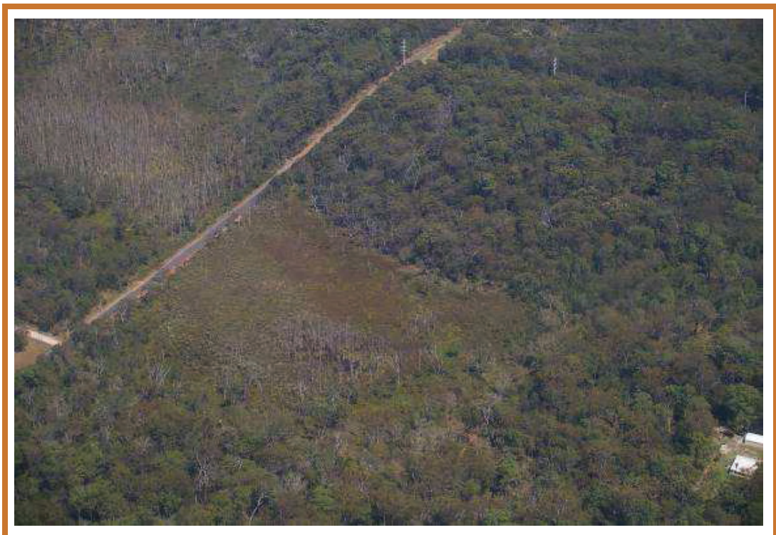
Figure 11.2: Site 5, Russell Island (adjacent wetland already in Council ownership)