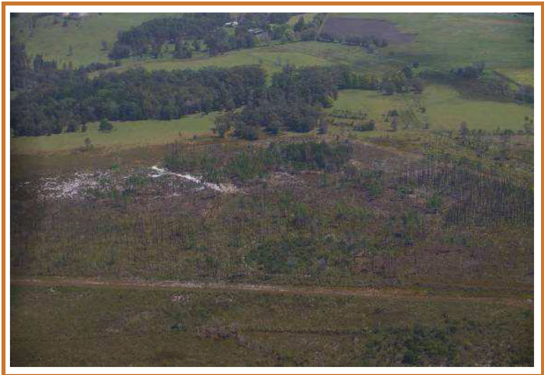
Figure 11.8: Site 20, Broadwater