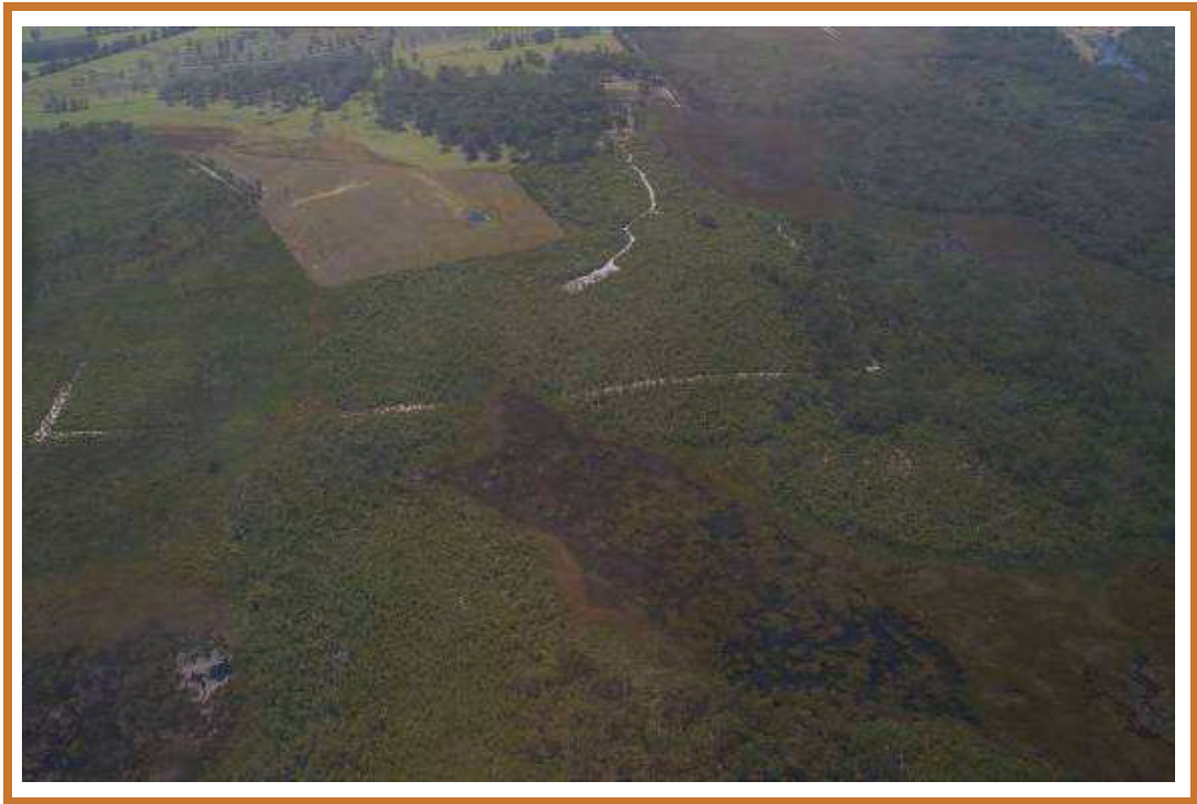
Figure 11.7: Site 19, Broadwater