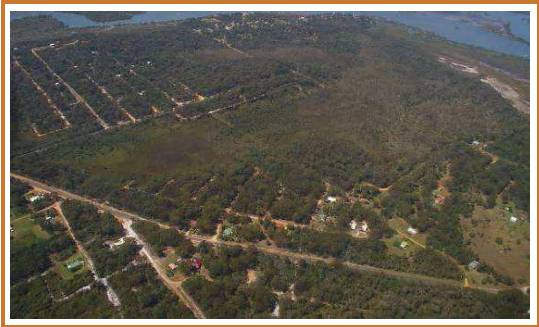
Figure 11.1: Site 5, Russell Island (target wetland)