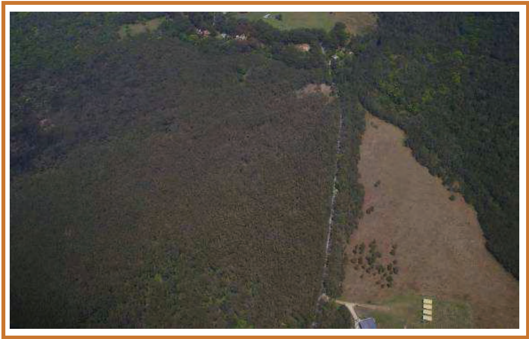
Figure 11.3: Site 14, Skidders Shoot