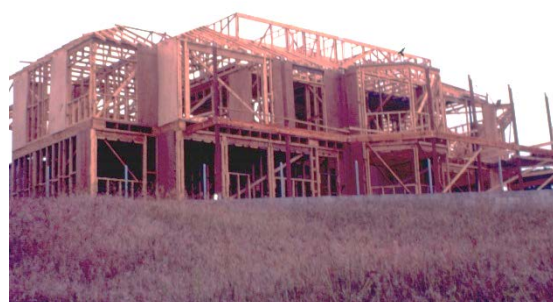
Figure 5 - With slab-on-ground construction, many areas are inaccessible for inspection.

Care must be taken to ensure that alterations or additions to a building, landscaping or storage of susceptible materials beneath or abutting the building do not allow termites to bypass the existing physical barriers.