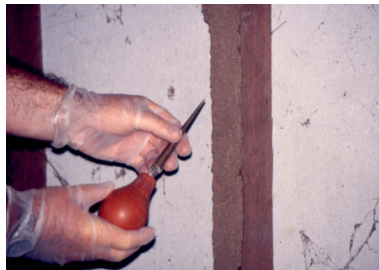
Figure 6 - Toxic dust can destroy the termite colony.

Toxic dust may destroy a termite colony even when the nest has not been located (Figure 6). Only an experienced operator, licensed to obtain and use the dust can carry out the treatment.