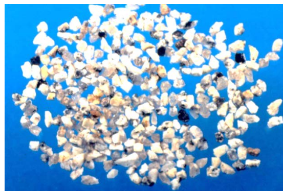
Figure 4 - Graded stone barriers consist of compacted rock particles.

The vertical face of the perimeter of slabs should be permanently exposed for a minimum of 75 mm unless other barriers are installed.