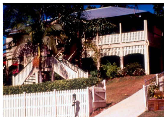
Figure 2 - For suspended timber floors, termite shields and routine inspections provide adequate protection.