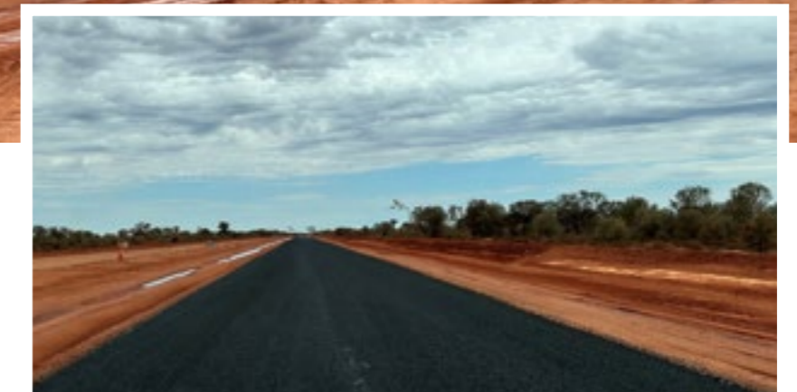
▲ Quilpie Adavale Red Road, Quilpie Shire Council