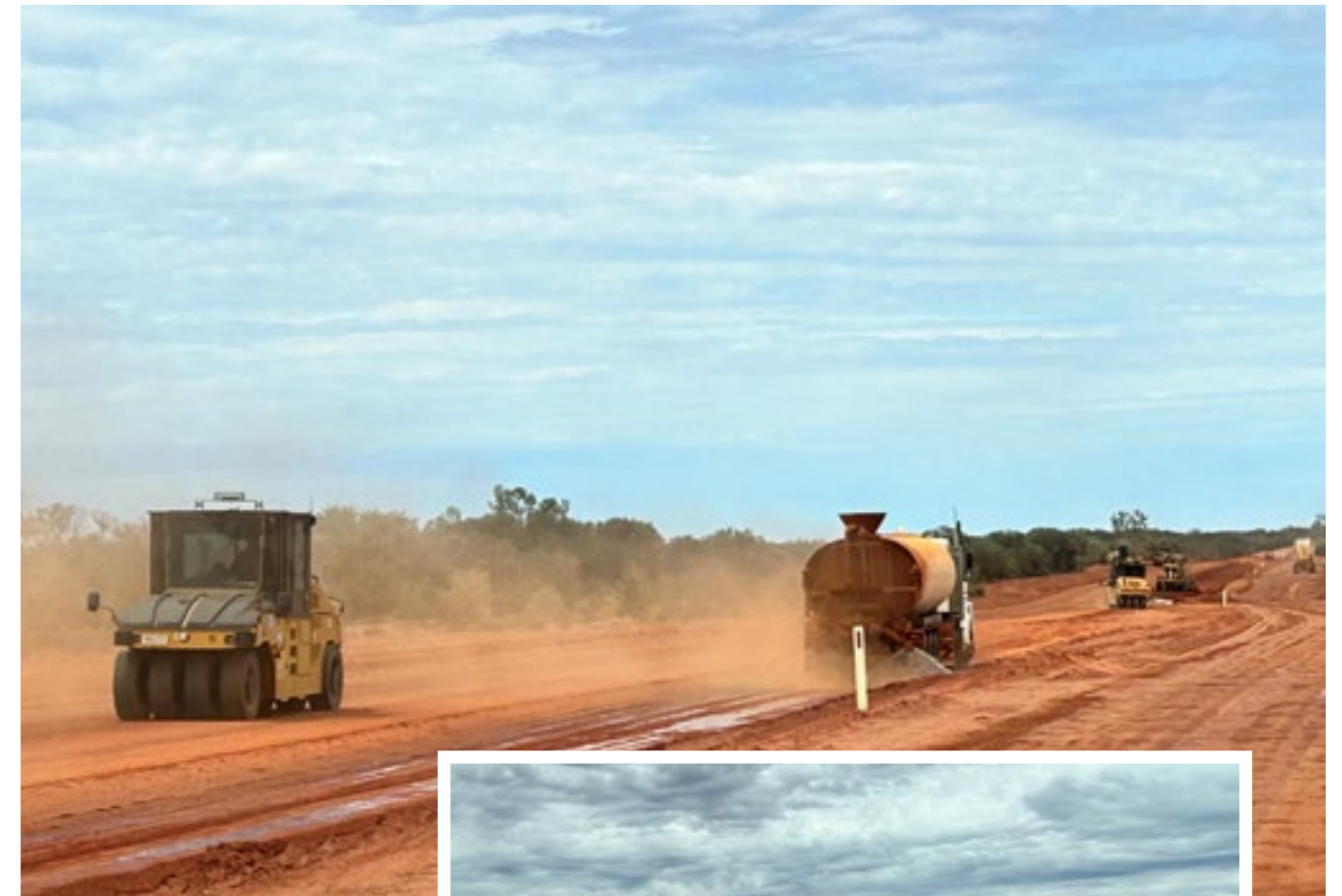
▲ Quilpie Adavale Red Road, Quilpie Shire Council - during construction