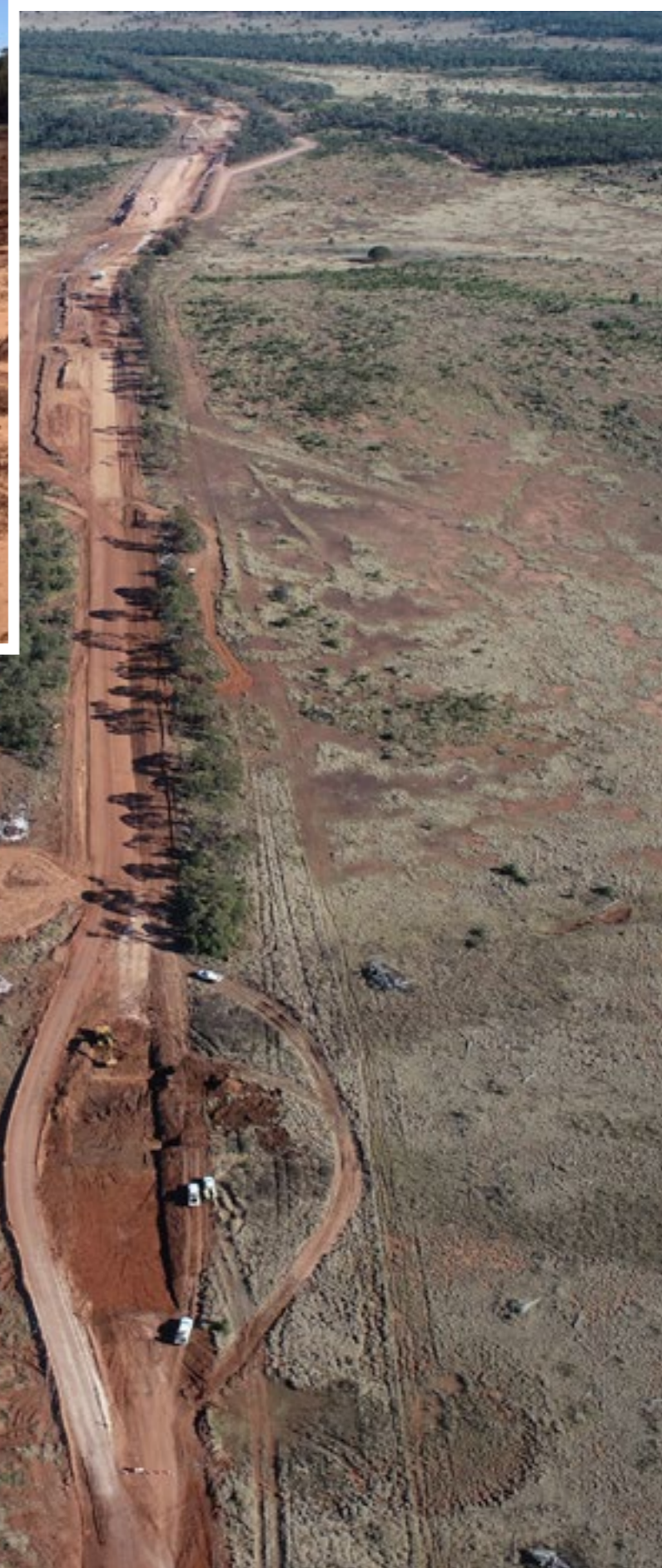
Aerial view of Bollon Road, Maranoa Regional Council

The project is funded through the 2023–24 state government TIDS program, with a contribution of approximately $1.736 million matched by Maranoa Regional Council, and $12 million from the Australian Government's Remote Roads Upgrade Pilot Program.