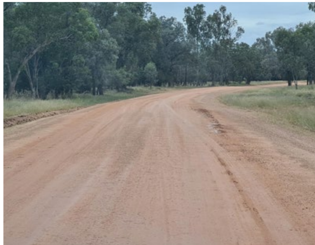
Whyenbah Road, Balonne Shire Council ▲