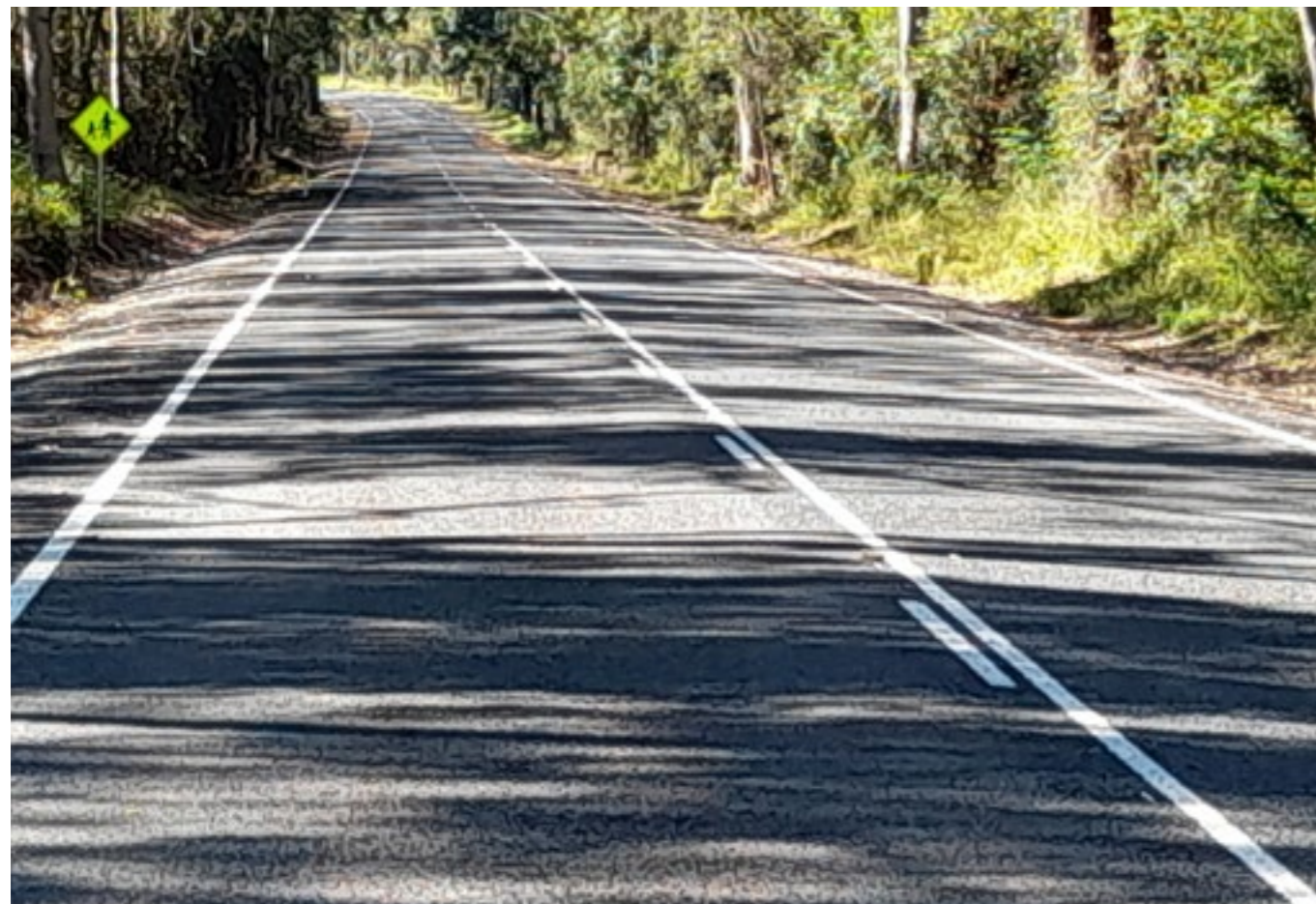
▼ Mt Tabor Road, Murweh Shire Council - completed