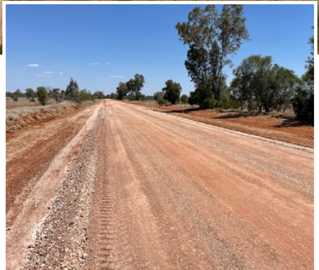
▲ Jakelwar-Goodooga Road North, Balonne Shire Council - during upgrade