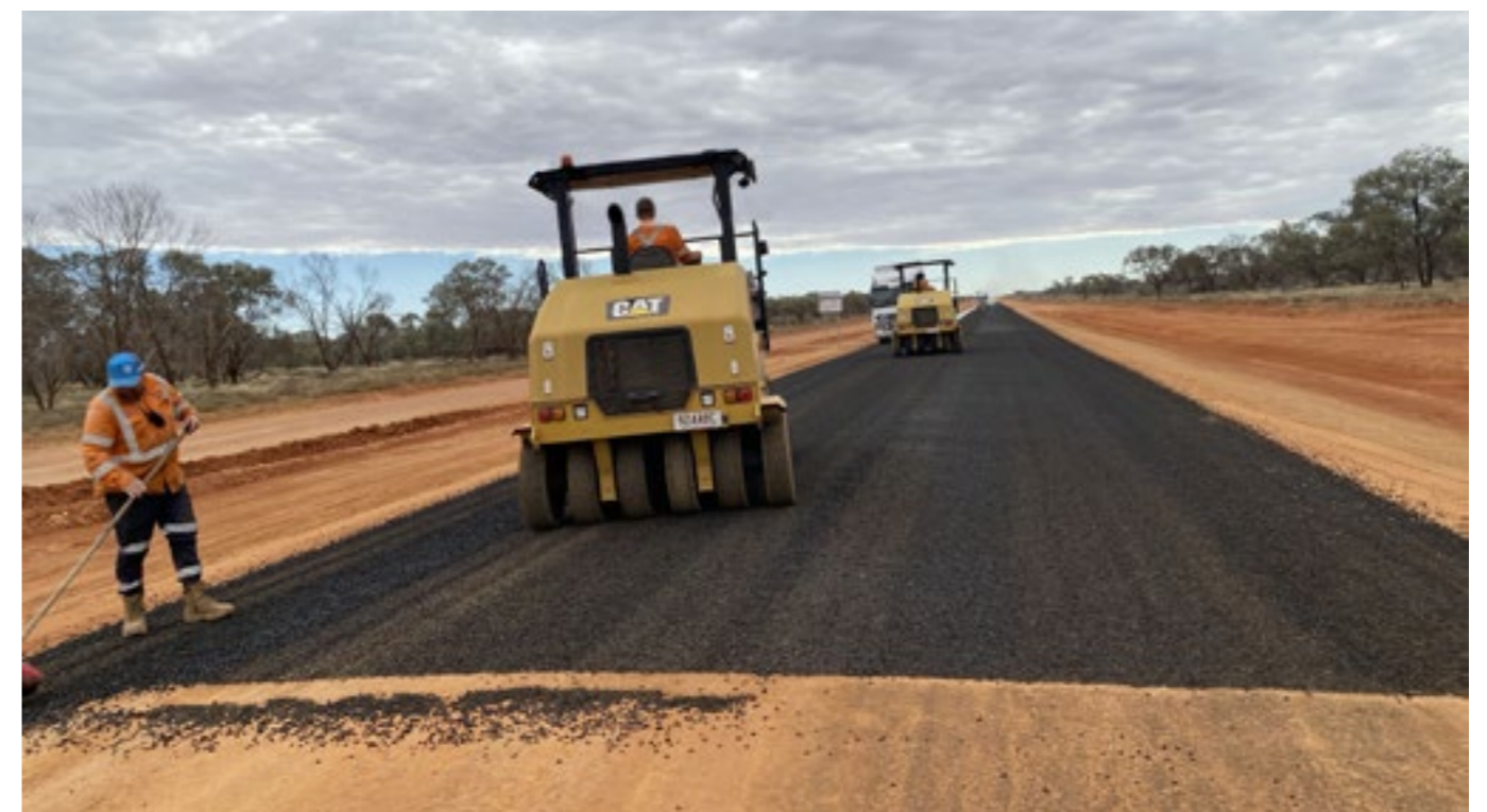
First seal of Quilpie Thargomindah Road, Bulloo Shire Council