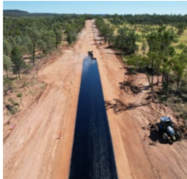
▲ Sealing of Mt Tabor Road, Murweh Shire Council

This project increased the resilience of the local transport network by minimising the impact of heavy vehicles, primarily road trains carting cattle, following minor rainfall events.