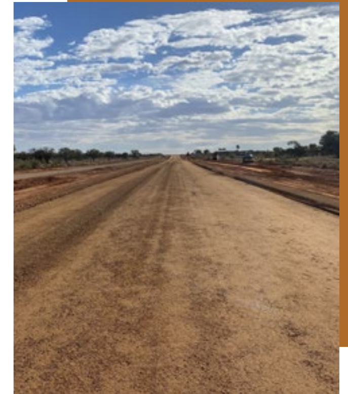
Quilpie Thargomindah Road, Bulloo Shire Council - prepared for sealing

The council appreciates funding provided through the TIDS program as it ensures important projects that improve the safety of regional roads can be achieved.