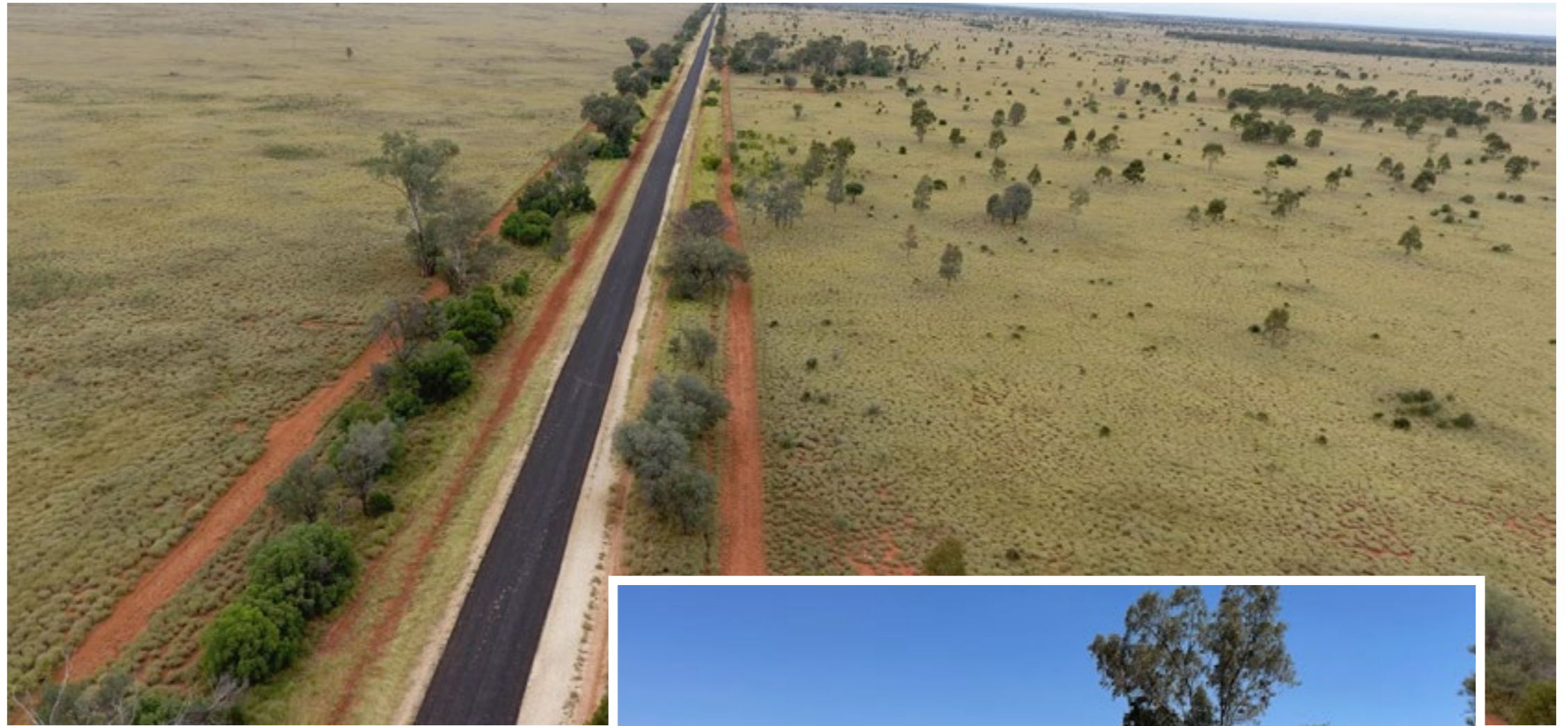
▲ Jakelwar-Goodooga Road North, Balonne Shire Council - completed