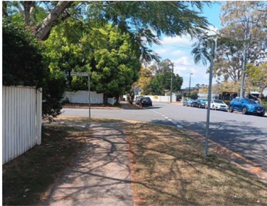
Gray Avenue, Brisbane City Council pre-construction

The project provides benefits for all road users at the intersection, in particular pedestrian access and safety, making the crossing task easier while encouraging students and pedestrians to cross at a designated location and promoting slower vehicle movements.