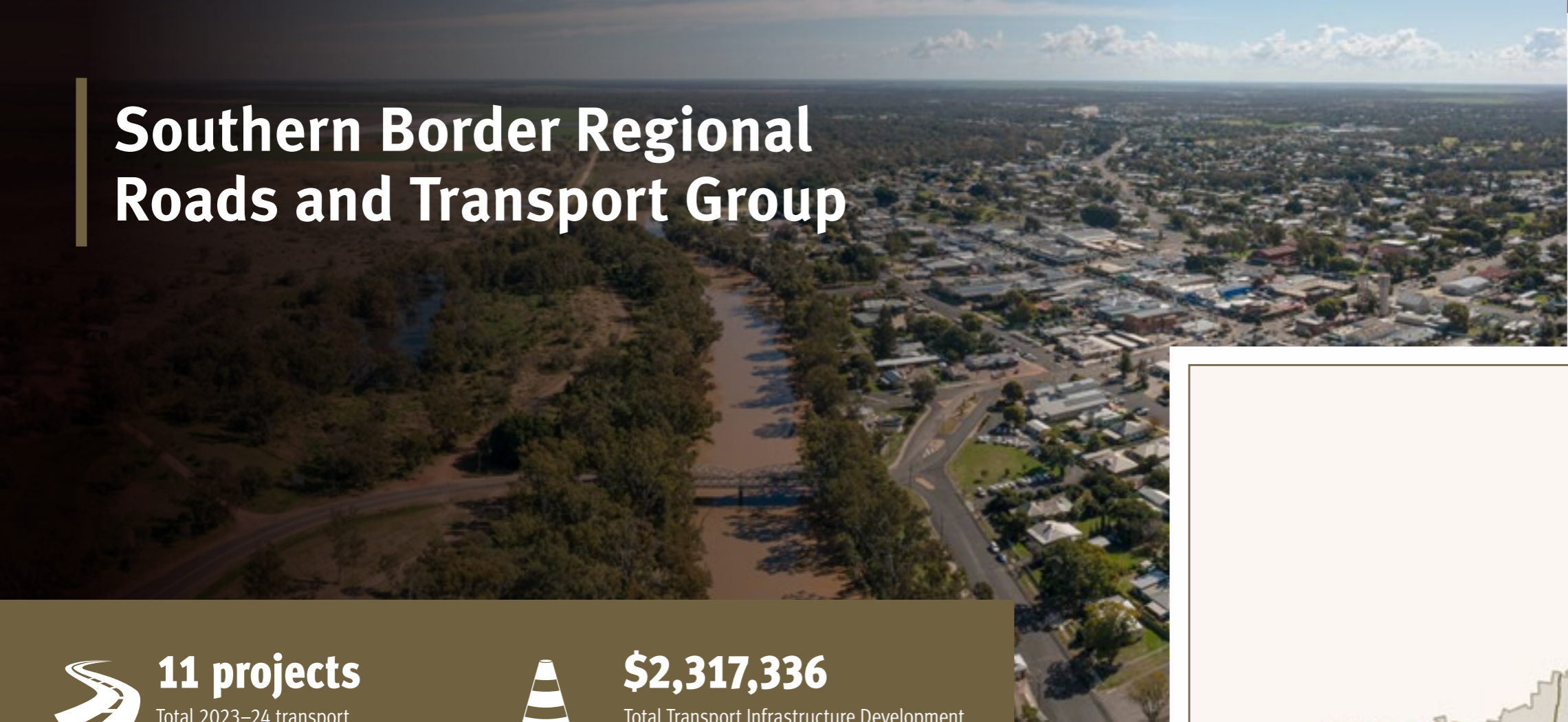
◀ Goondiwindi Queensland, the town on the Macintyre river.