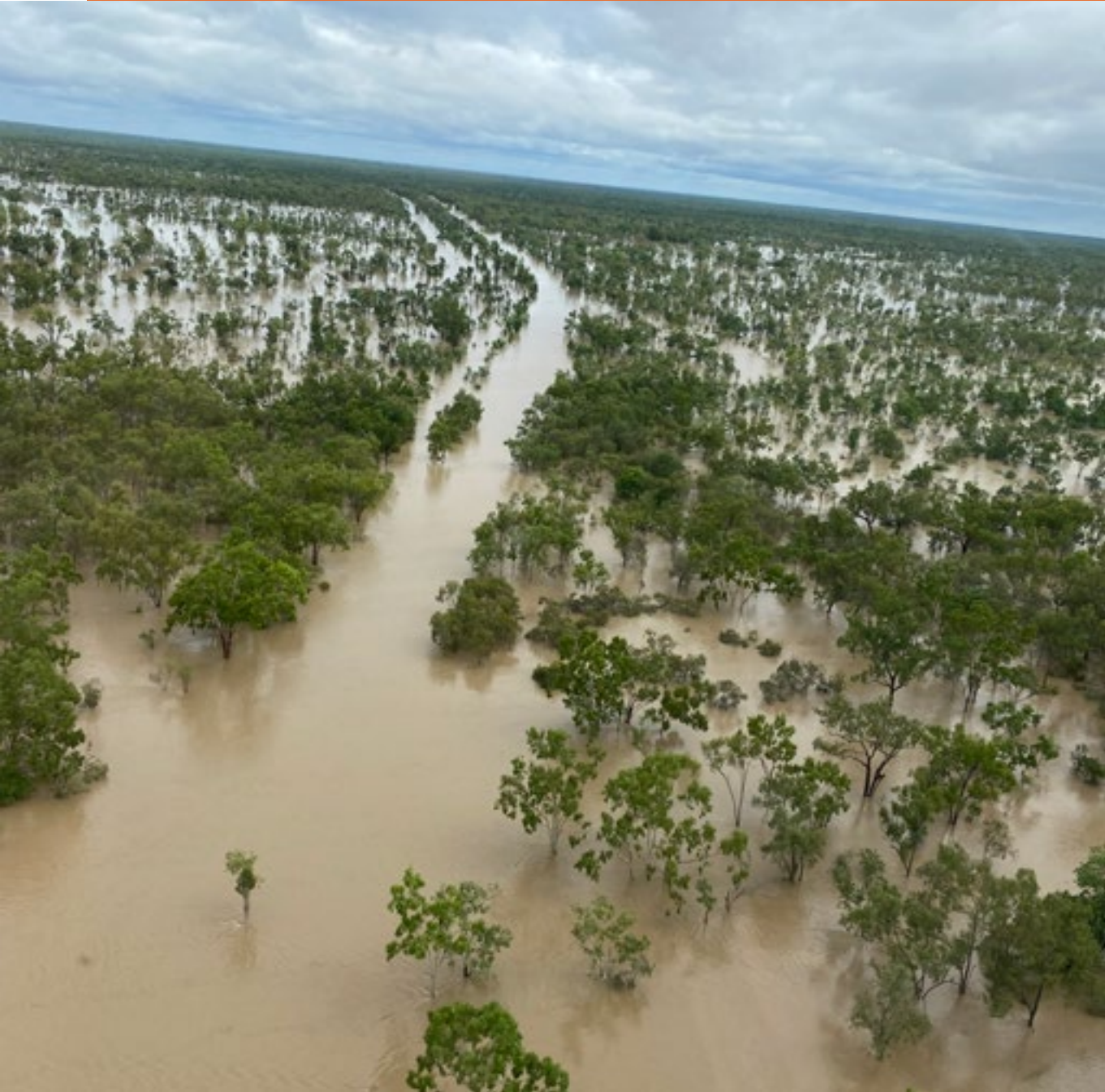
▲ Flooding of Kowanyama Road, Carpentaria Shire Council due to Cyclone Jasper