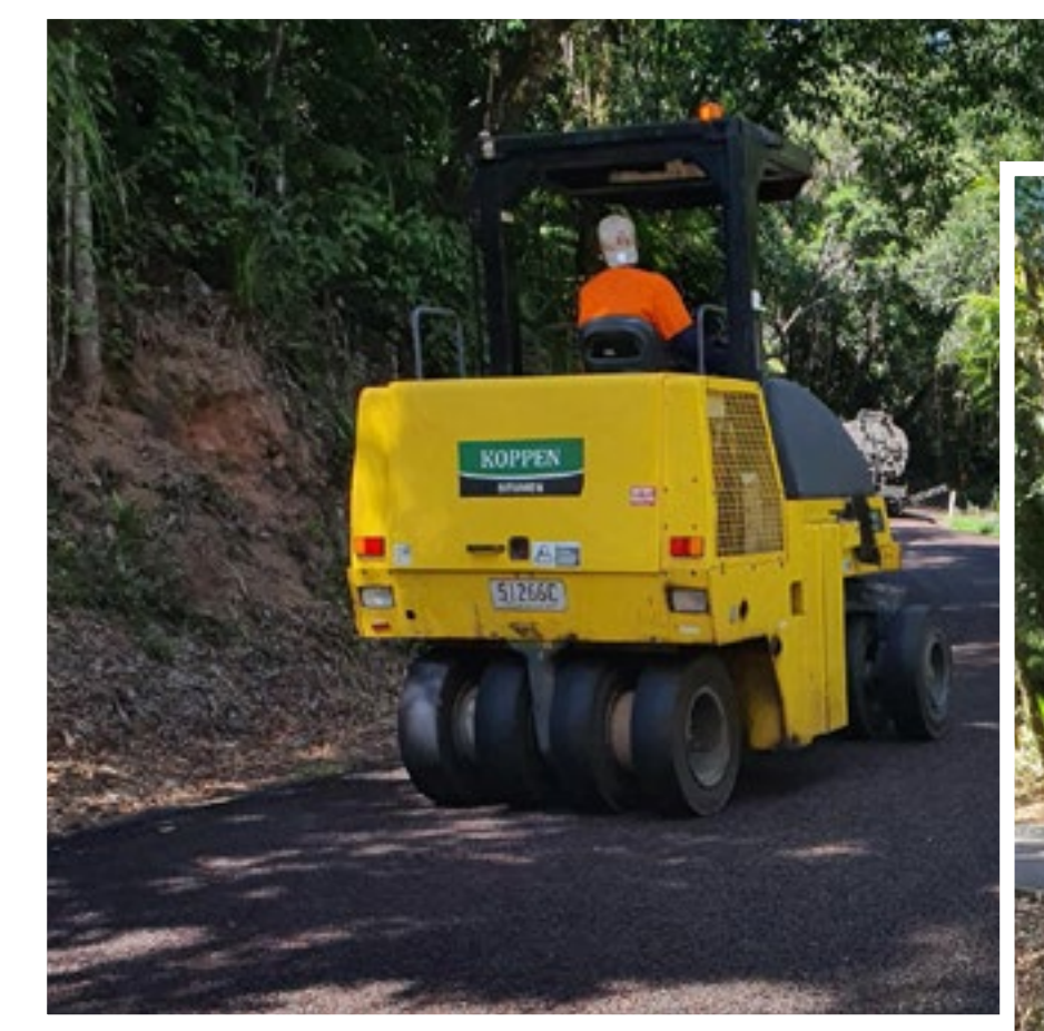
Wallaman Falls Road, Hinchinbrook Shire Council - seal during construction

This project was undertaken in late August 2023, and the road and surface has remained in an optimal and secure condition.