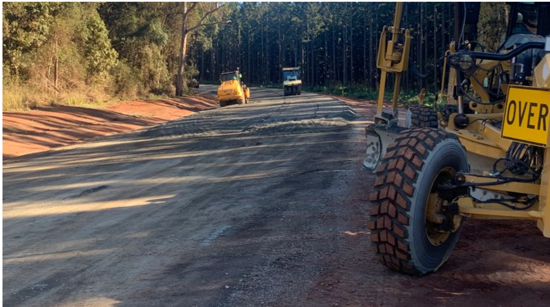
◀ Nukku Road, Toowoomba Regional Council during construction