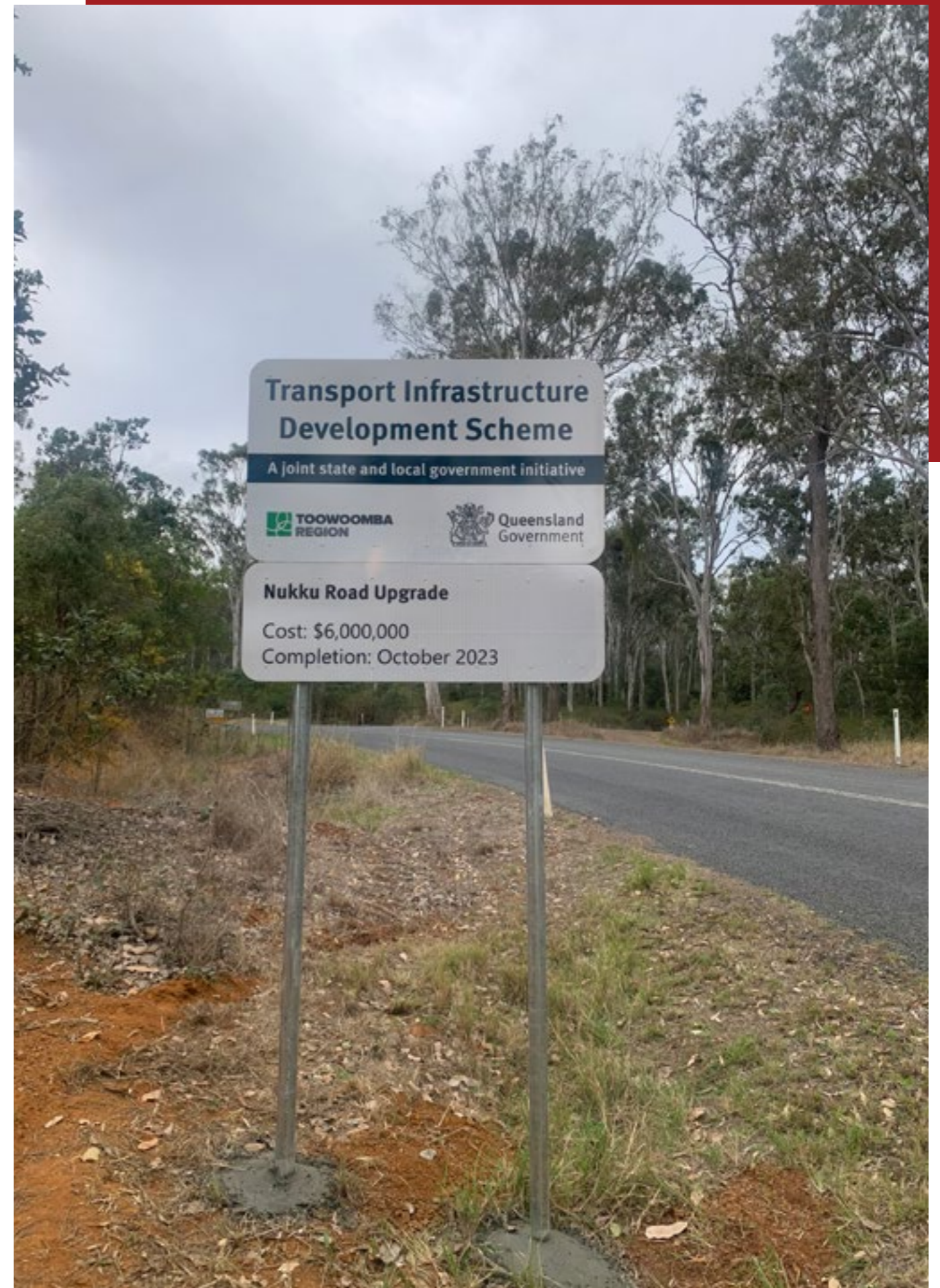
Nukku Road Upgrade, Toowoomba Regional Council