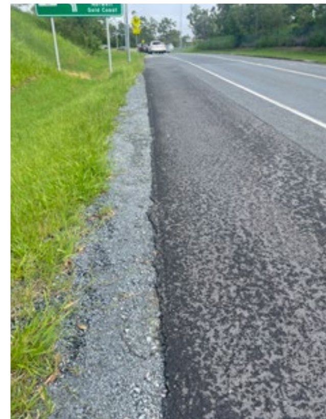
Tillyroen Road, Gold Coast City Council - post construction