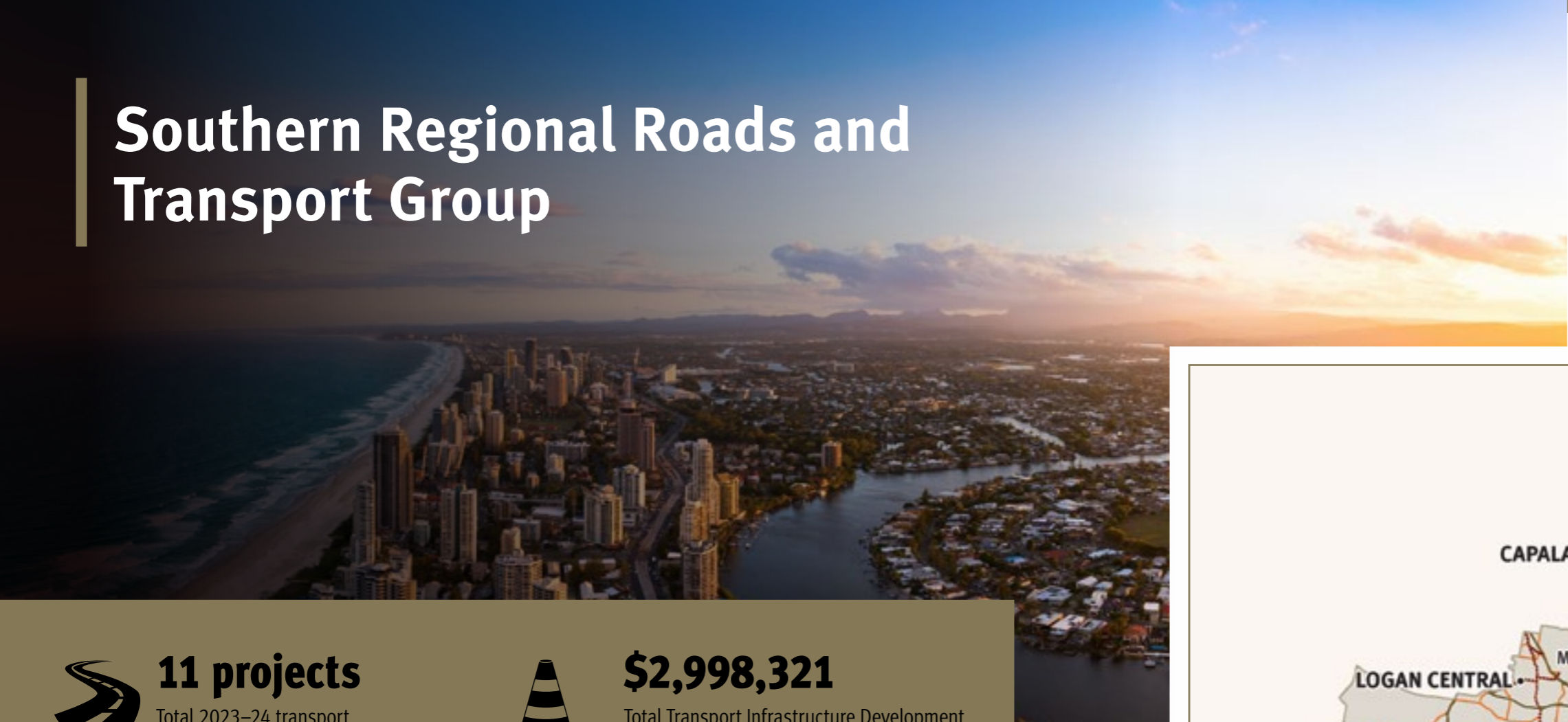
Panorama of Southern Gold Coast looking towards Broadbeach