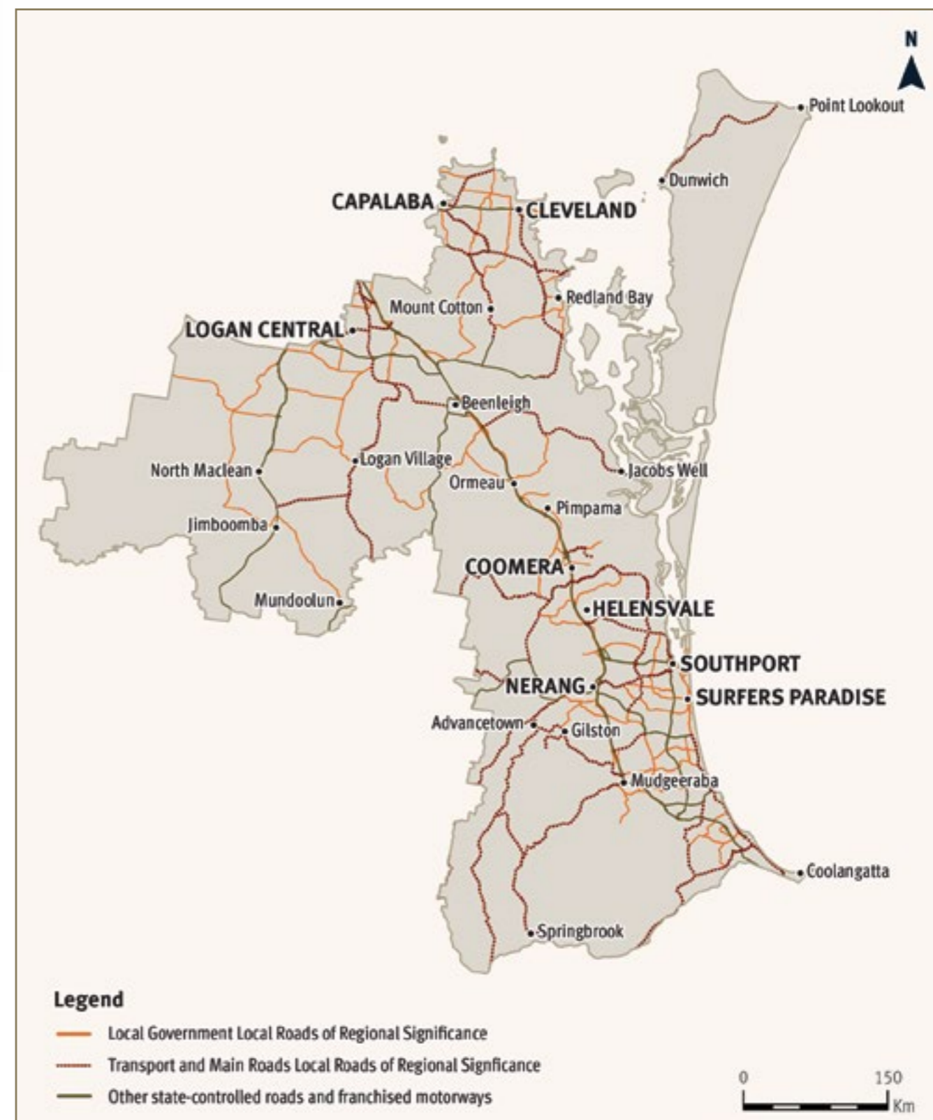
Southern RRTG map