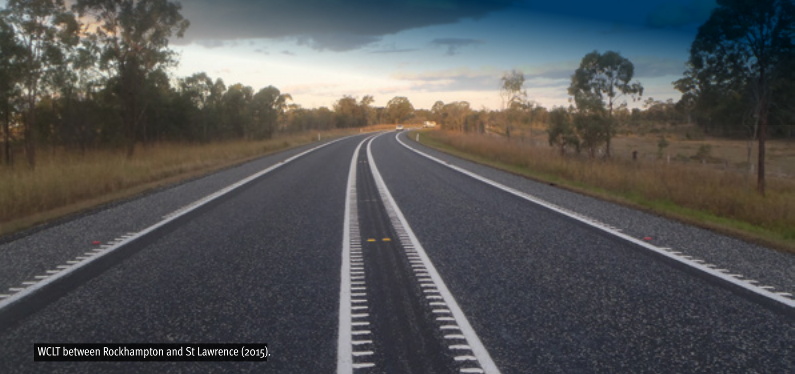
WCLT between Rockhampton and St Lawrence (2015).