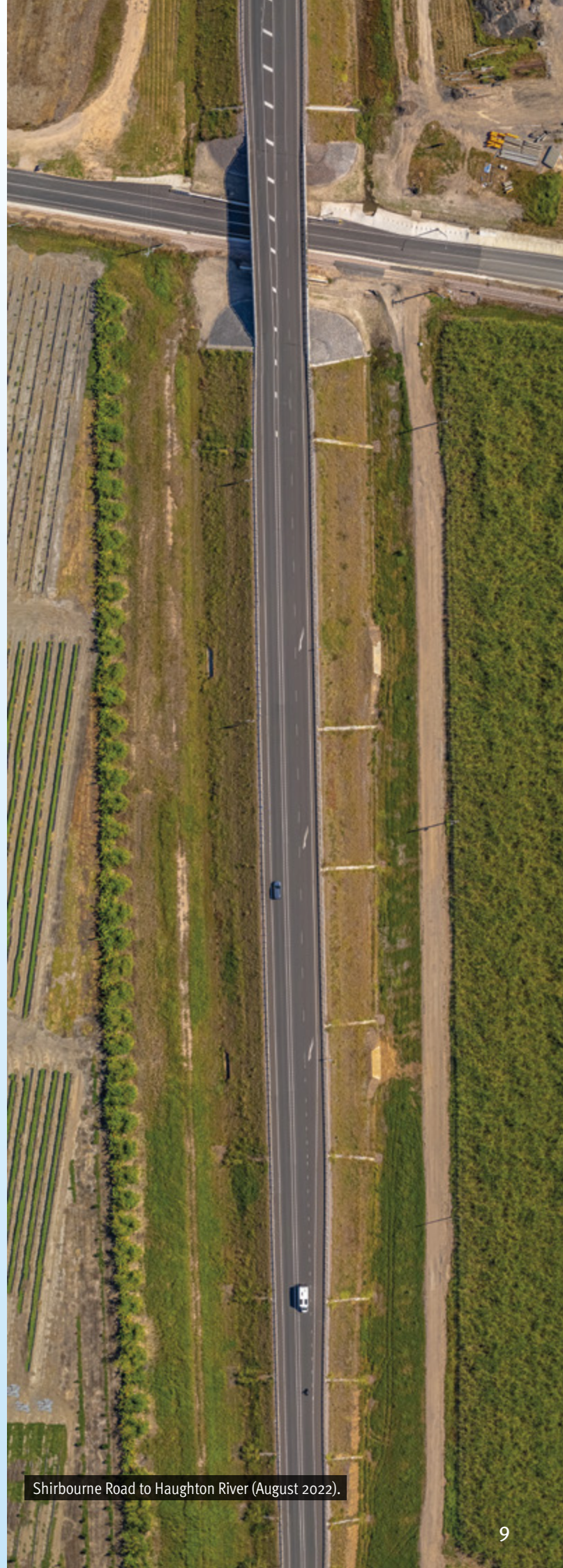
Shirbourne Road to Haughton River (August 2022).

The BHTAC is supported by a Technical Working Group established within the Department of Transport and Main Roads (TMR) comprising technical and subject-matter experts.