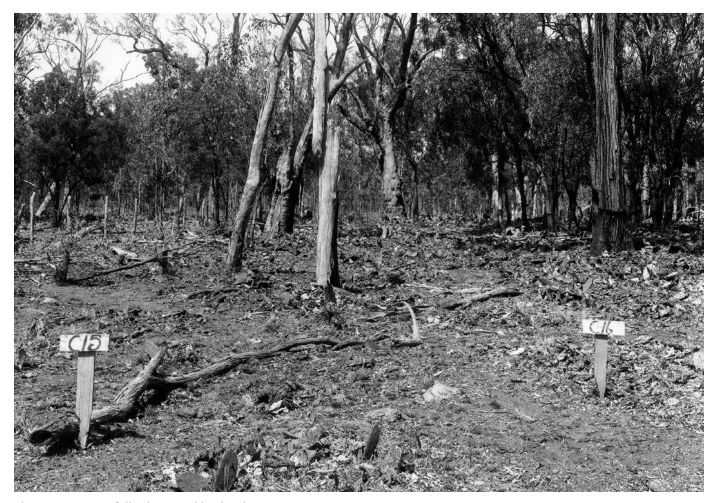
The same property following cactoblastis release

Fact sheets are available from biosecurity.qld.gov.au. The control methods recommended should be used in accordance with the restrictions (federal and state legislation, and local government laws) directly or indirectly related to each control method. These restrictions may prevent the use of one or more of the methods referred to, depending on individual circumstances. While every care is taken to ensure the accuracy of this information, the department does not invite reliance upon it, nor accept responsibility for any loss or damage caused by actions based on it.