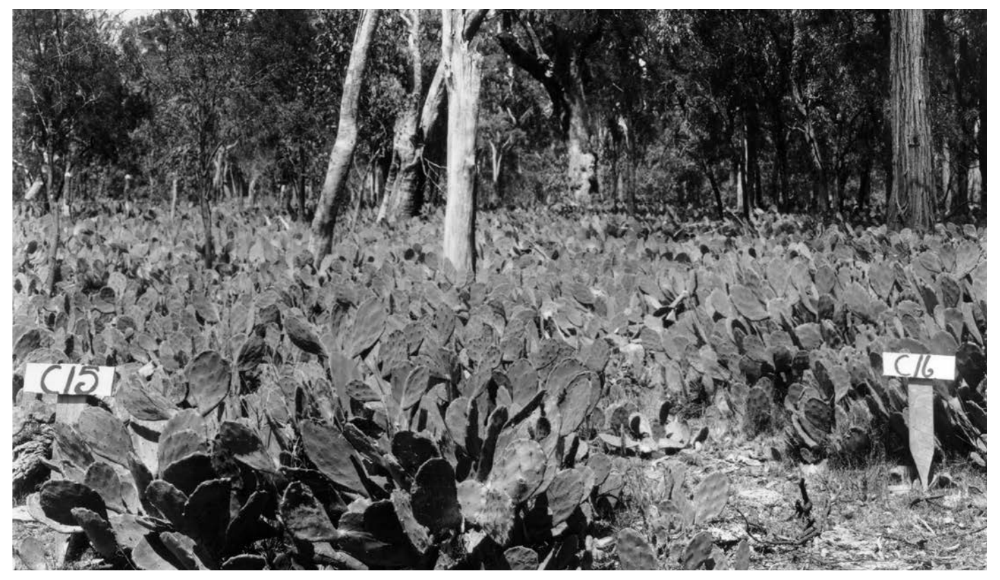
Property infestation before the release of cactoblastis