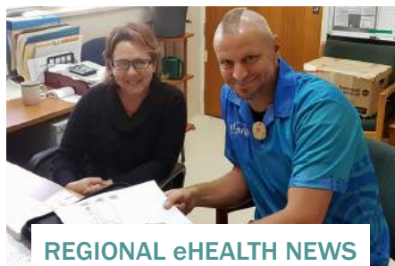
REGIONAL eHEALTH NEWS