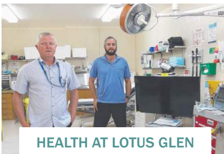
HEALTH AT LOTUS GLEN