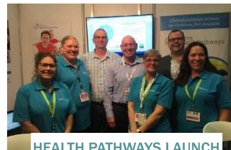
HEALTH PATHWAYS LAUNCH