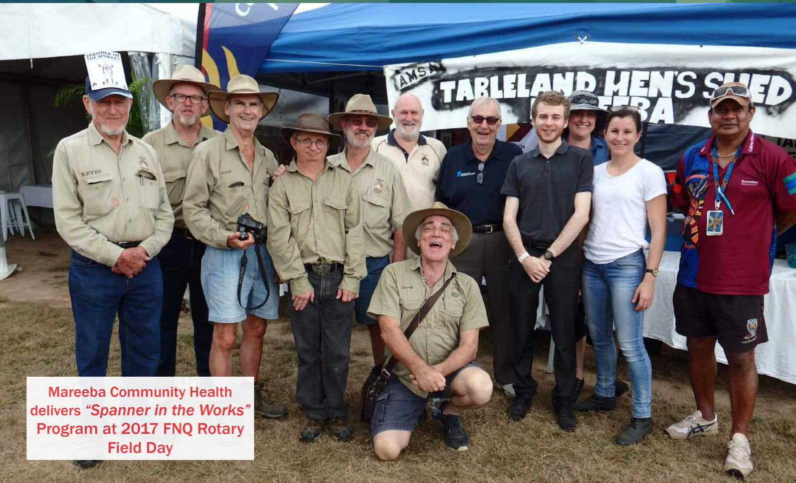
Mareeba Community Health delivers “Spanner in the Works” Program at 2017 FNQ Rotary Field Day

Mareeba Community Health staff in collaboration with Mareeba Men’s Shed, FNQ Prostate Cancer Support Group, Valuing Mental Health and Wellbeing, James Cook University, Atherton Community Health and Mareeba Rotary delivered a successful “Spanner in the Works Program” at the recent FNQ Rotary Field Day. Over the course of the three day event, the nurses, medical students, Indigenous Health Workers and Allied Health staff screened over 100 men and provided health information to around 160 men. Mareeba Community Health has been involved with the “Spanner in the Works Program” at the biannual Rotary Field Day for the past six years and it continues to be an important event on their community engagement and health promotion calendar. “Spanner in the works” is a male friendly health information and screening program is auspiced by the Australian Men’s Shed Association. Participants complete a Type 2 Diabetes Risk assessment, Coping Skills assessment and can have their blood pressure checked along with waist measurements. The