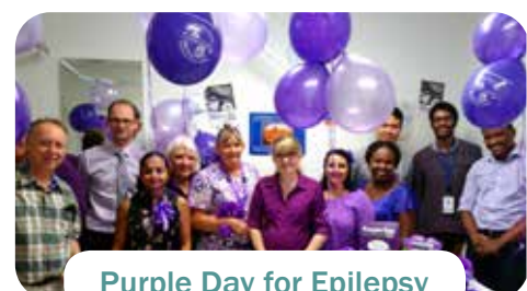
Purple Day for Epilepsy