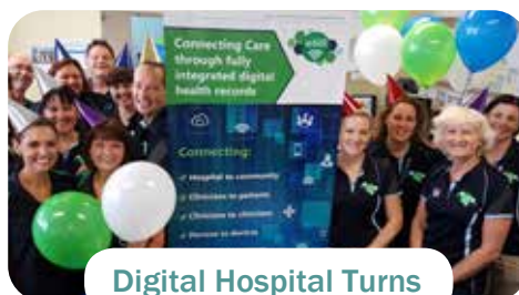
Digital Hospital Turns One