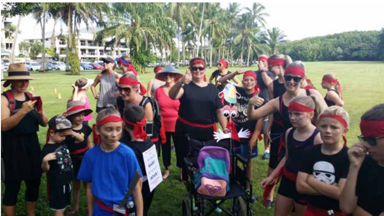
Team ninja getting ready for take off

“Did you know that there are more than 8000 known rare diseases affecting approximately two million Australians (of which up to 400,000 are children).”