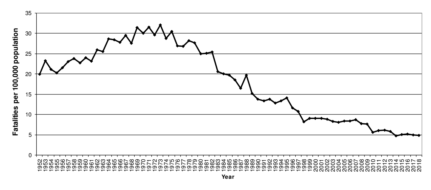
Figure 1: Fatalities per 100,000 population, Queensland, 1952 to 2018

The Queensland road fatality rate for 2018 was 4.89 fatalities per 100,000 population, which is 2.5% lower than the rate for the previous year of 5.01. This is the second lowest road fatality rate recorded for a calendar year since accurate records began in 1952. The lowest Queensland road fatality rate of 4.72 occurred during 2014 and the third lowest road fatality rate of 5.01 occurred during 2017.