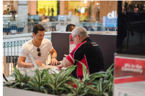
PACIFIC FAIR SIGNING SITE, BROADBEACH

While the statistics collected at present are rudimentary, a clearer picture is emerging of the effect each signing site has in its community.