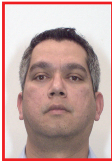
Chin too high