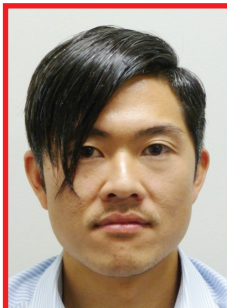
Hair over face