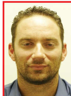
Eyes partly closed