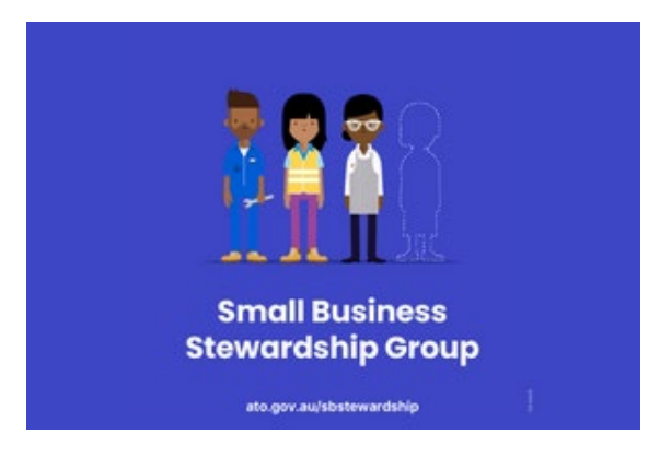
Small Business Stewardship Group membership – nominate now