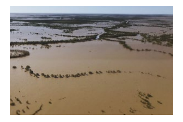
Assistance for flooded producers and businesses