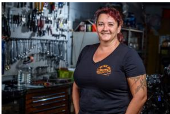
Indigenous Business Month is here!