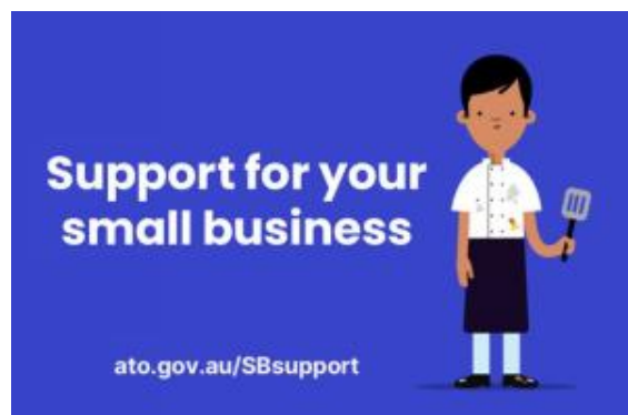
Indigenous Business Month – ATO webinars